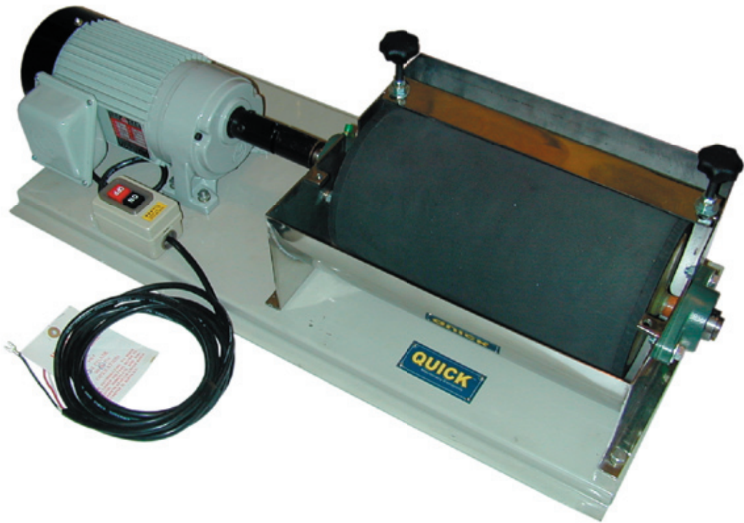
Table-Top Glue Applicator Installation & Operation Manual